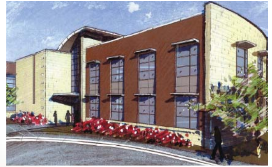
Bids have been solicited for the College of Nursing building. They will be opened later in January.